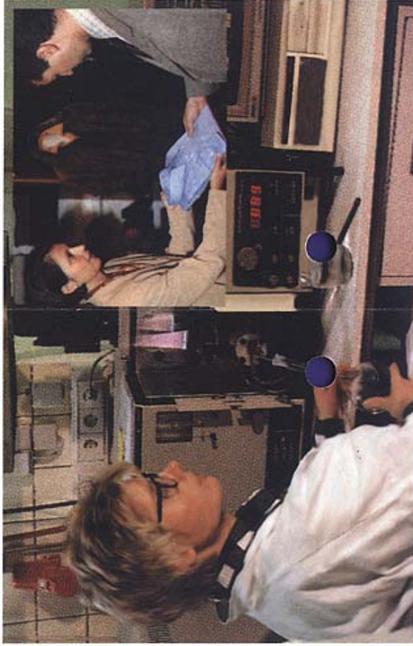
Consultation services for requirement Öko - Tex Standard 100 implementations

The amount of time spent for the activities will depend on specific condition in each participating company.