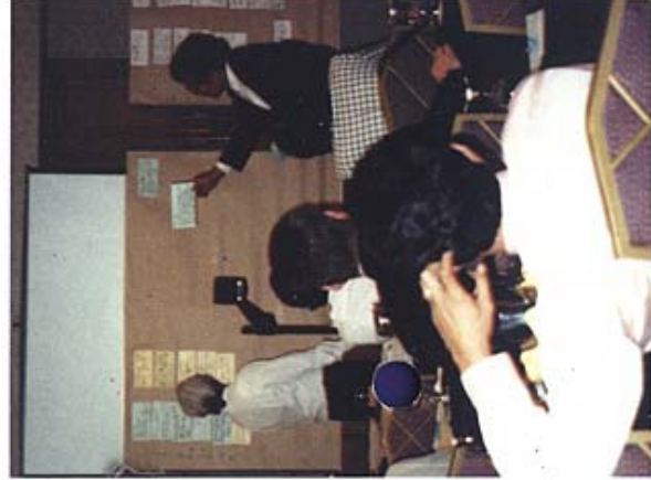
Safety recommendation requirement Öko - Tex Standard 100