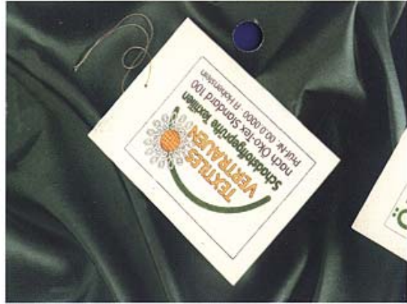
Standard implementations Öko - Tex Standard 100